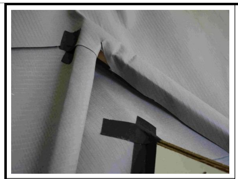
Detail of membrane overlaps sticking at dormer's ridge and membrane fixing over valley counter battens